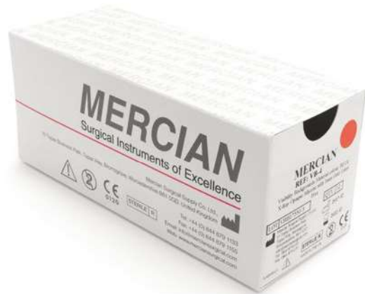
Supplied sterile in boxes of 12 pieces

The material has a none reflective surface eliminating distractions from theatre lighting and has a non-tacky finish to aid mobilisation of the Vessel.